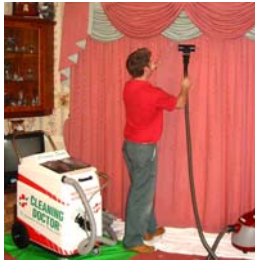
Curtain Cleaning Curtains, swags, tails and pelmets all cleaned on site – there is no need to take down for cleaning.