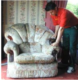
Upholstery and Soft Furnishings A deep extraction clean of your upholstery and soft furnishings highlights the colours and patterns.