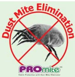
Allergy Sufferers Benefit from our Dust Mite elimination programme for carpets, upholstery and mattresses.