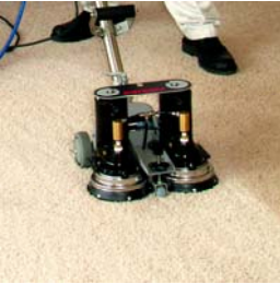
Deep Extraction Carpet Cleaning Cleaning right down to the base of your carpet to remove harmful grit, dirt, stains and pollutants.