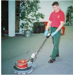
Dry Fusion Cleaning is a great low-moisture, quick-drying system for carpets, carpet tiles and rugs – domestic or commercial.