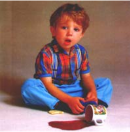
Stain Protection Stain protector applied to your carpets and soft furnishings makes this less of a disaster.